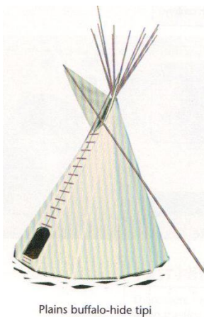
Plains buffalo-hide tipi